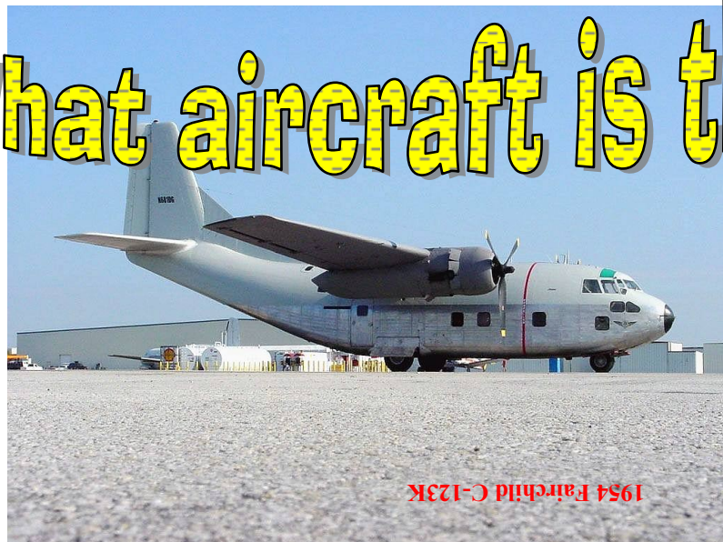
1954 Fairchild C-123K